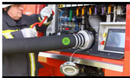
00:04 / 00:16