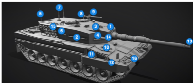
Húzza az egeret az ábrában a folyószámok fölé!